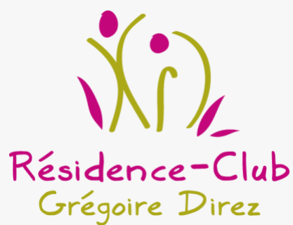
Mailly-le-Château, Résidence Club Grégoire Dizez