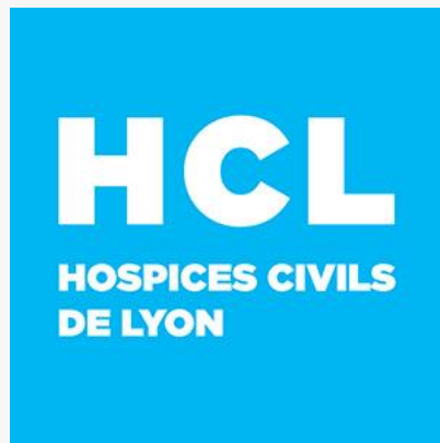
Hospices Civils de Lyon