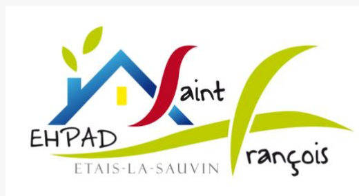
Étais-la-Sauvin, EHPAD Saint-François