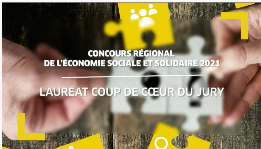
ABB Reportages has just been awarded the Jury's Favourite Prize of the Regional Conference on Social and Solidarity Economy of Bourgogne-Franche-Comté, for its project « TANGO FOR SENIORS » !

Click on the picture to watch the award ceremony